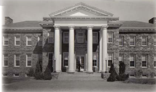
"Old Main" Campus 1933-1970