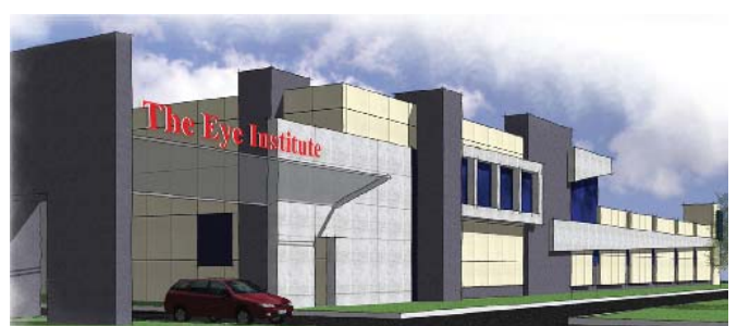
Our Future is Here The Eye Institute: Our New Look 2011 and beyond