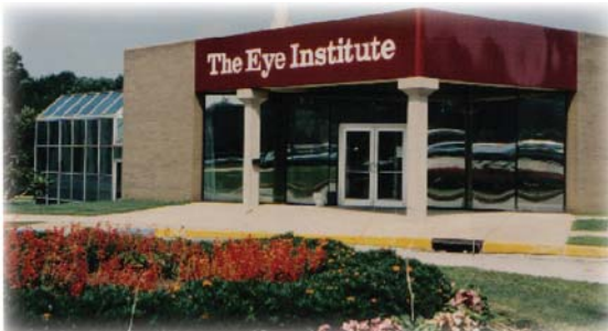
The Eye Institute 1978 until 2010

The "New" Eye Institute will enrich the patient experience by creating a pleasant environment and a design that supports a more efficient experience. The Eye Institute's investment in our patients' vision care experience is our way of saying thank you for years of loyalty to us.