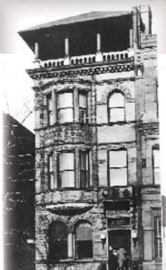
Original Site 1809 Spring Garden Street 1919-1932

• When complete, the clinical facility will have one central entrance located on the west side of the current building. This will allow for improved patient flow and enhanced security. This entrance will be accessed most conveniently through the current Godfrey Avenue driveway. The newly designed clinical facility will continue to offer free parking for its patients and staff.