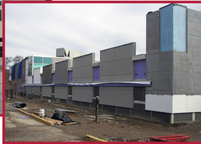
Above: Architect renderings of The Eye Institute's new entrance; Left: The steel beams for the canopy entrance of The "New" Eye Institute, opening Summer 2011, are erected; Right: The 15,000 square foot build-out of the building's lower level facing Godfrey Ave.

Over the past eight months, local residents, patients, and The Eye Institute's staff and doctors have watched the building at 1200 West Godfrey Avenue be transformed. In May of this past year, following the official groundbreaking, the construction company began removing trees and leveling the land in preparation for the build out of the 15,000 square foot addition to the lower level. The exterior walls now have a finished surface. The steel work for the entrance canopy has been erected and the majority of the construction has moved inside. Renovation on the closed-in ground level began in the fall. As the interior walls on this level were constructed, the overall colors for the fixtures and finishings were finalized and the furniture was chosen. With studs in place, the drywall was mounted in December. The roof on the expansion has been put down and all electrical work including data and telephone wiring has started.