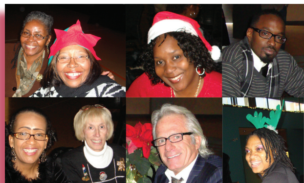
The Eye Institute's festive staff celebrated the holiday on December 17th at Salus University's annual party.