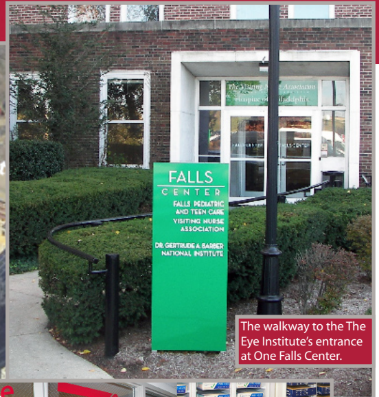
The walkway to the The Eye Institute's entrance at One Falls Center.